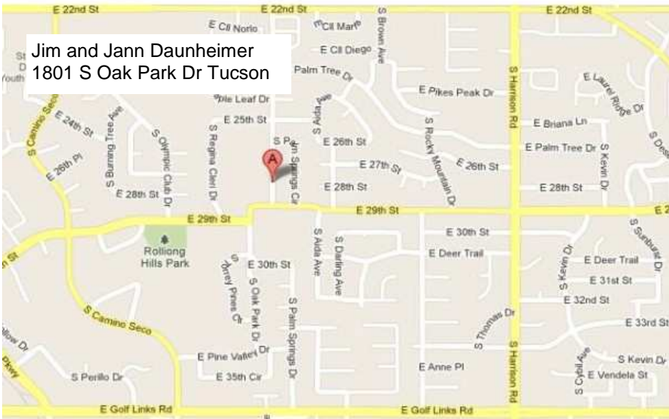
From 22nd, South on Harrison, West on 29th St, North on Oak Park Dr to address.